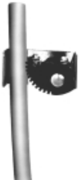
hose and bracket